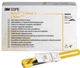
RelyX™ Unicem 2 Clicker™ Dispenser Refill – A2 (56875)