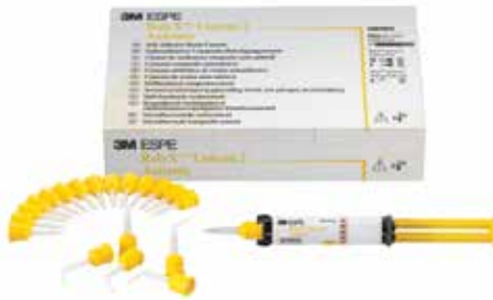
RelyX™ Unicem 2 Automix Cement Refill – A2 (56846)