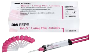
RelyX™ Luting Plus Automix — Trial Kit (3535TK)