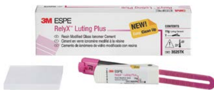
RelyX™ Luting Plus Clicker™ Dispenser — Trial Kit (3525TK)